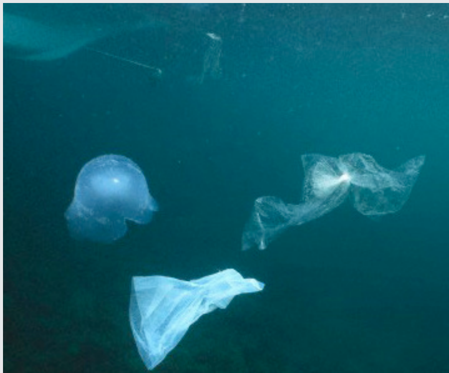
Different marine plastics resemble foods eaten at various trophic levels. These plastic bags look like the jellyfish eaten by turtles.