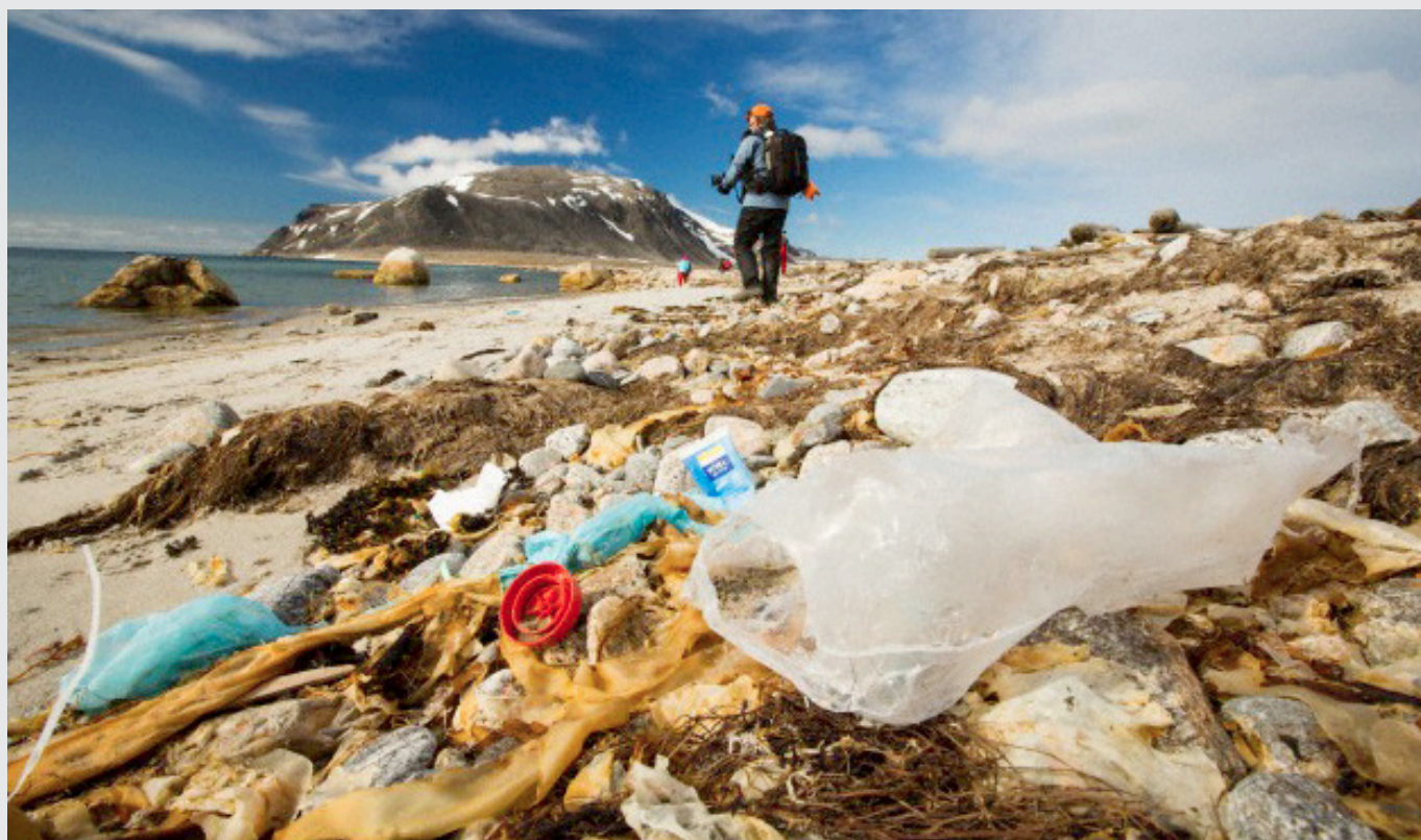
Plastic debris can travel far from its point of departure—this beach in Svalbard, Norway, for instance, is only about 600 miles from the North Pole. A 2014 study reported finding large quantities of microplastics frozen into Arctic ice. 52

There is a lack of controlled experimental work completed on the topic, Clarke adds, and it’s very difficult to disentangle pollutant exposures and bioaccumulation via plastic versus food and environmental sources. Uncertainties also surround the transfer of plastic additives to marine