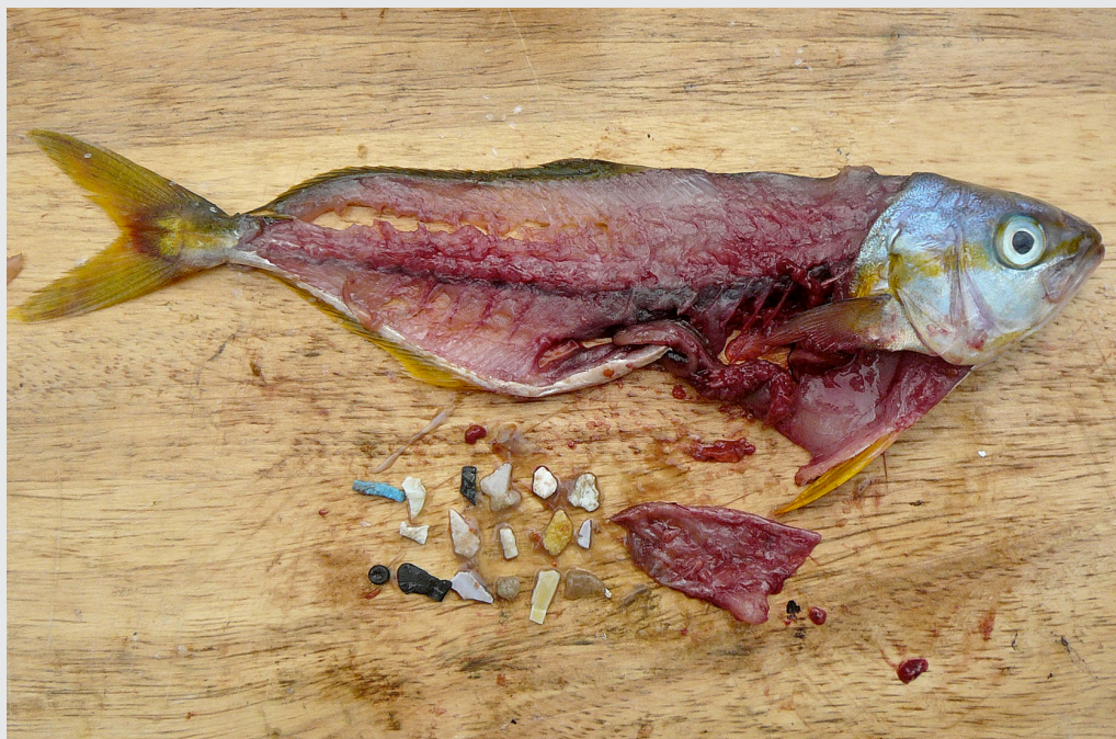
This rainbow runner had consumed 17 plastic fragments. Marine plastic pollution plays an unknown role in human exposures to toxic chemicals. Regardless of what that role may turn out to be, sources for this story believe we have options for realizing the benefits of plastics without the hazards of marine pollution.