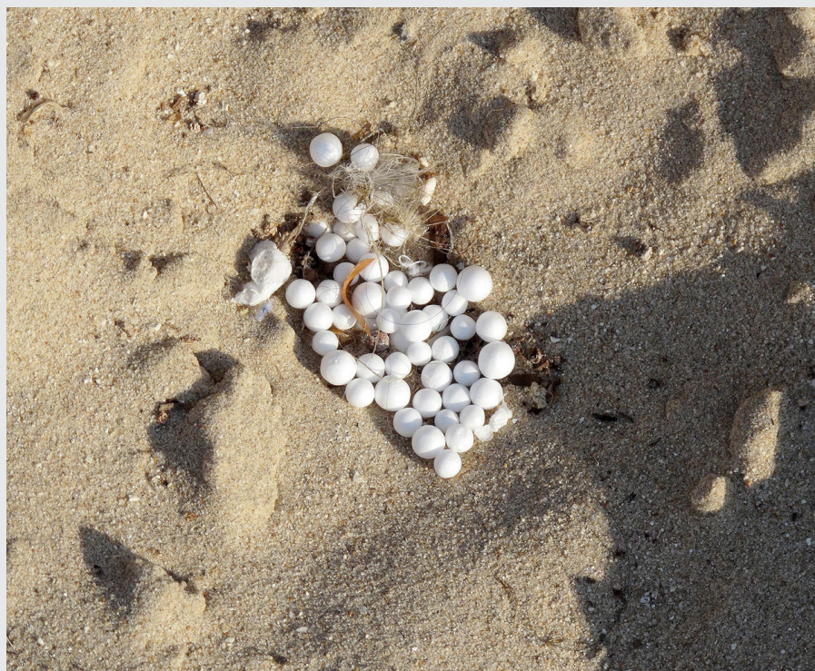
Small plastic pellets known as nurdles are used as a feedstock for producing plastic goods. In July 2012 Typhoon Vicente swept more than 165 tons of nurdles from a cargo ship off the coast of Hong Kong. 53