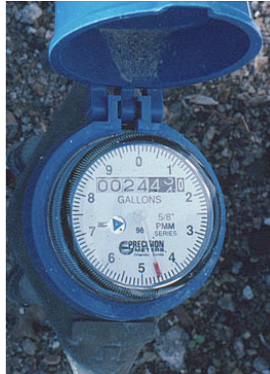
Figure 1. A Precision series water meter, installed at the irrigation back flow prevention device, which measures the volume of water applied to landscaped surface areas.

Mesic and xeric urban residential landscapes were chosen in south Tempe and Phoenix suburbs. Mesoscapes had turf and high water use plants while xeriscapes were chosen based upon desert-adapted plant recognized by local municipalities and the absence of turf. All landscapes were installed between 1985 and 1995. Total landscaped surface area and canopy cover was measured.