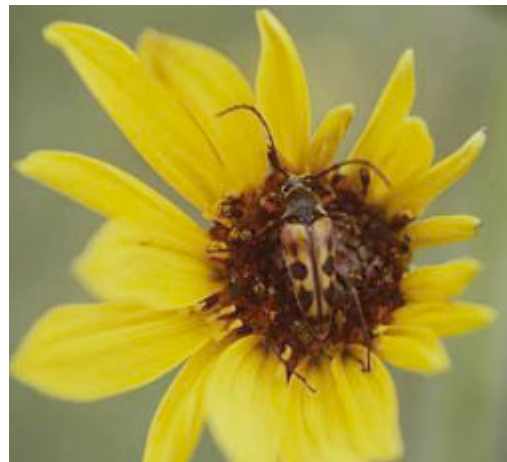
Figure 3. Approximately every third bite of food that you take comes from a plant that was pollinated by insects.