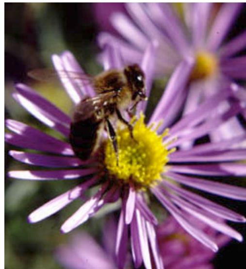
Figure 2. The honeybee ( Apis mellifera ) is an