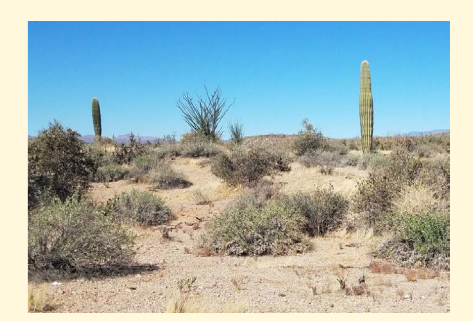
Natural Sonoran desert (McDowell Mountain)

Exploratory behavior represents how a bird would explore a novel area and has been connected to exploratory movements in the field [2, 3].