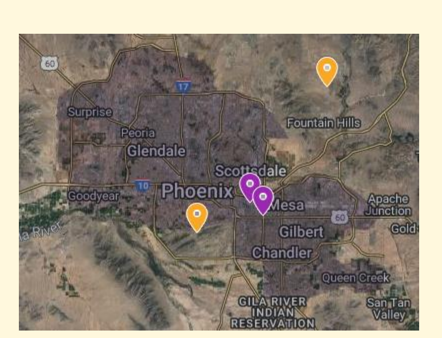
Field sites around Phoenix (urban and desert)