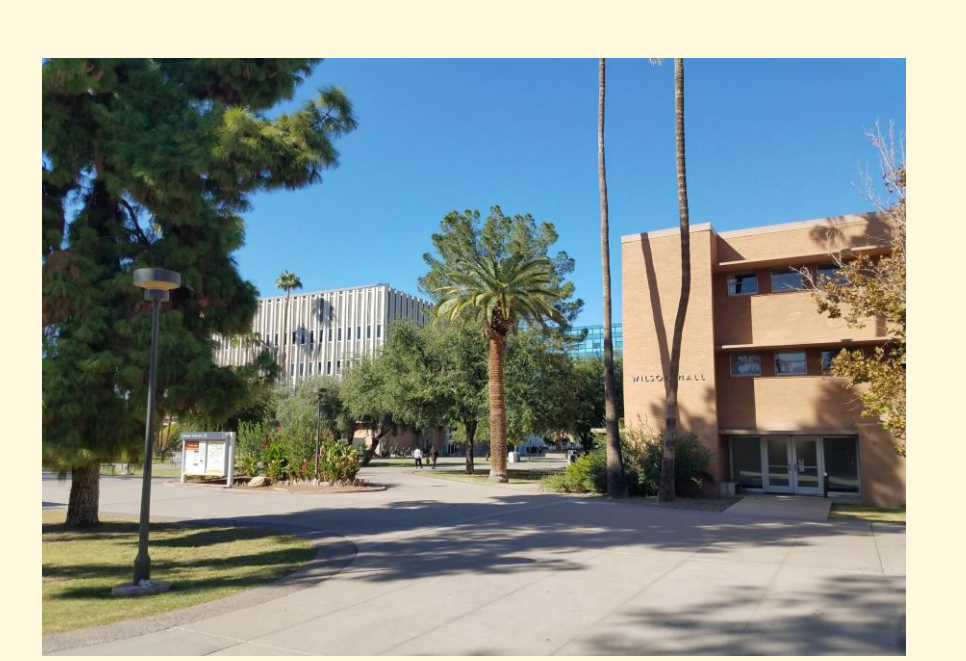
Urbanized habitat (ASU Tempe Campus)