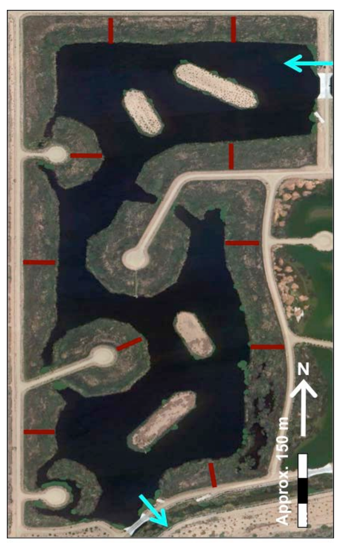
Figure 1. Constructed wetland study cell Arrows indicate location and direction of inflow(top arrow) and outflow(bottom arrow) sites. Red lines indicate transect locations.

We used the light and dark bottle method to measure DO at inflow and outflow sites within a single treatment cell of Tres Rios CTW every other month from May to November 2017.