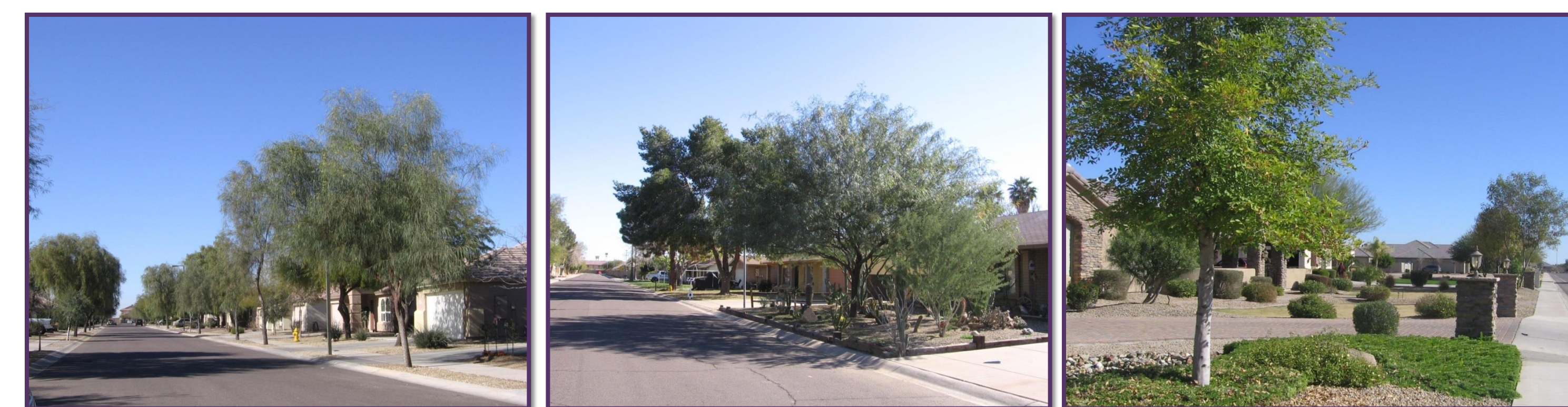
Figure 1. L-R: Centerra, Litchfield Shadows, and Sarival Gardens neighborhoods