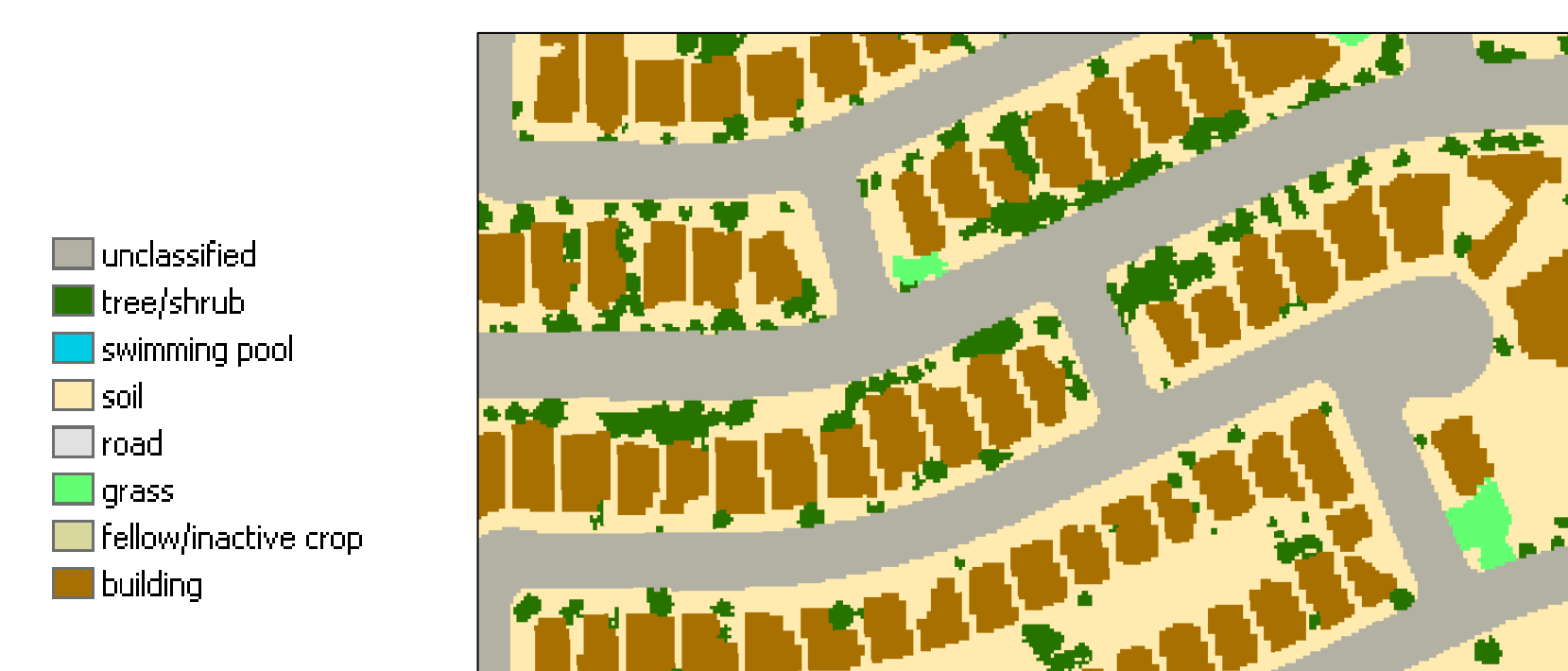
Figure 2. Sample NAIP data in the Goodyear neighborhoods

Our study has 7 independent variables including LotSize, BuildSize, TreeShrub, Grass, Soil, Pool, and HOA (dummy). LotSize and BuildSize were acquired from Maricopa County Assessor parcel records. The land cover variables, including Grass, TreeShrub, Soil, and Pool were acquired through object-oriented classification of the National Agriculture Imagery Program (NAIP) with a ~1.0 meter spatial resolution (Figure 3). NAIP data also include Building, FallowCrop, Road, and Unclassified land cover classifications that we did not use. Independent variables for land cover were converted to percent (%) of parcel, recognizing that HOA guidelines often require a percent cover. The dummy variable HOA designated whether a parcel was within an HOA (1) or not.