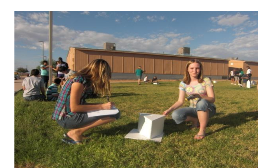
Students designing and testing their model houses