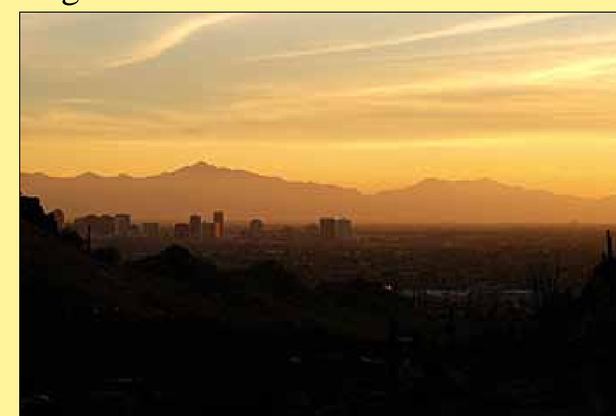
Figure 2: Metropolitan Phoenix