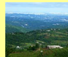
Figure 2. View of the Luquillo Mountains showing increasing coastal development and urbanization in the fringes of the forest.

Traditionally focused on understanding factors driving long-term change in tropical forest ecosystems, the LUQ-LTER is experiencing increases in human influences , with urban encroachment and recreation use having local and regional impacts on forest cover and quality of ecosystem services, such as water (Figure 1 and 2) (ITES and IITF, 2006).