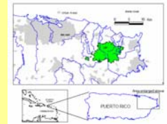
Figure 1. Map of the Luquillo LTER. The gray in the upper map show urban regions, and the green outlines the Luquillo Experimental Forest, site of the Luquillo LTER.

Institutional factors and research activities of the LTERs highlighted in this poster provide guidance to other sites beginning to incorporate social science, such as the Luquillo LTER (LUQ-LTER) in Puerto Rico.