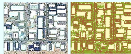
Figure 4. A sample site of industrial landscape from the digital image (left) with 71.29 % TISC; the classified land cover results (right): ISC-I (brown color) = 39.28 %, ISC-II (yellow color) = 32.01 %, The green color areas are pervious surface.