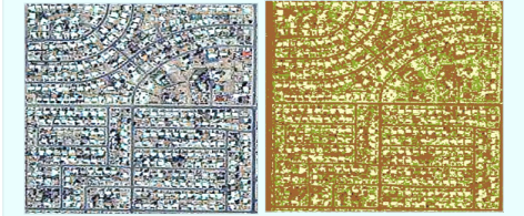
Figure 5. A sample site of high housing density residential landscape from the digital image (left) with 73.33 % TISC; the classified land cover results (right): ISC-I (brown color) = 47.43 %, ISC-II (yellow color) = 25.90 %, the green color areas are pervious surface.