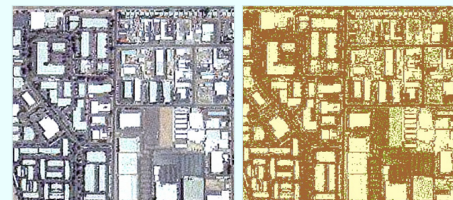
Figure 3. A sample site of mixed industrial-commercial landscape from the digital image (left) with 90.78 % TISC; the classified land cover results (right): ISC-I (brown color) = 51.54 %, ISC-II (yellow color) = 39.24 %, The green color areas are pervious surface.