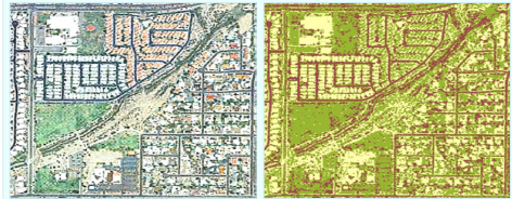
Figure 6. A sample site of mixed residential-recreational landscape from the digital image (left) with 50.40% TISC; the classified land cover results (right): ISC-I (brown color) = 21.49%, ISC-II (yellow color) = 28.91%; the green color areas are pervious surface.