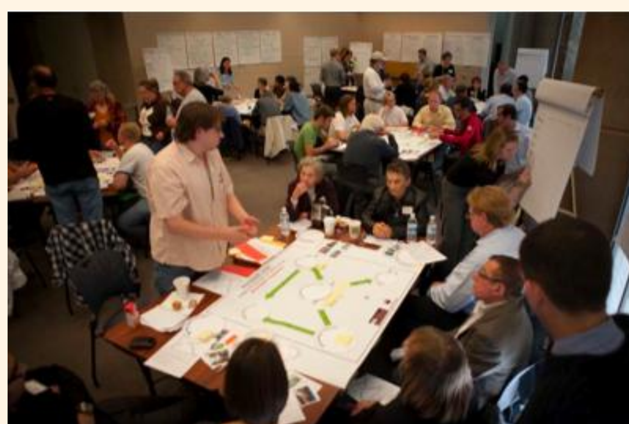
March 6th, 2010 Visioning Workshop with the City of Phoenix Planning Department and Citizen Stakeholders